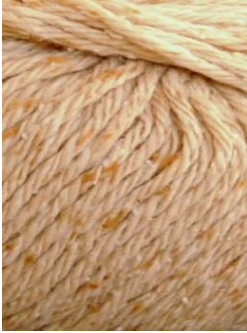
59 Vainilla Vanilla