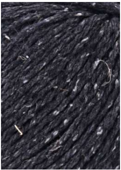
58 Gris Oscuro Dark Gray