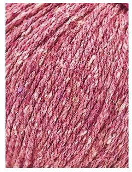
66 Rosa Pink