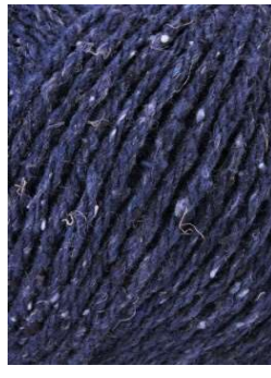
52 Marino Blue Navy