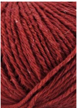
60 Rojo Oscuro Dark Red