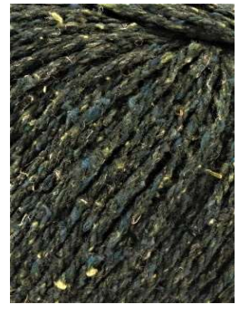
55 Verde Green