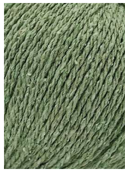
64 Verde Claro Sage