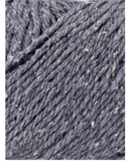
57 Gris Claro Light Gray