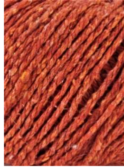
56 Caldera Copper