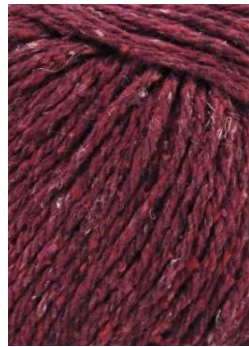
54 Granate Garnet