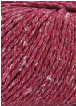
53 Fucsia Fuchsia