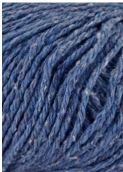
61 Azafata Royal Blue