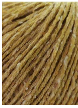
62 Trigo Wheat