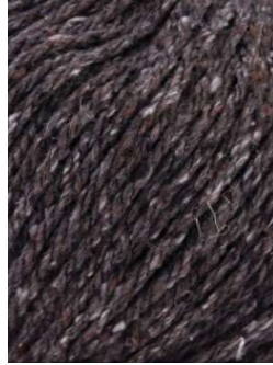
51 Piedra Stone