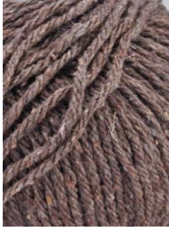
50 Marrón Brown