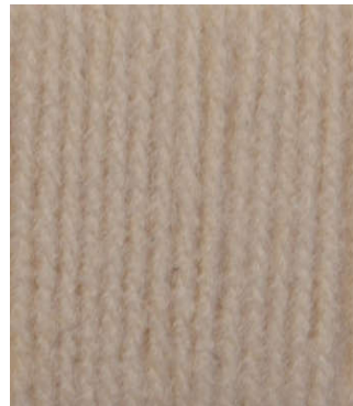
8041 Beige Beige