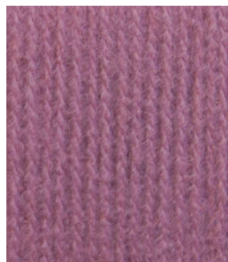
8049 Rosa Palo Pale Pink