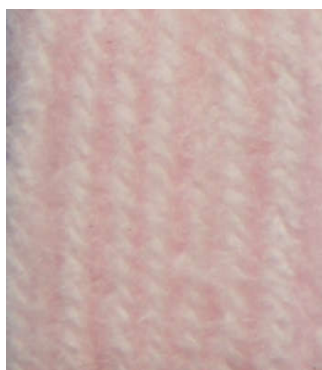
8003 Rosa Pink