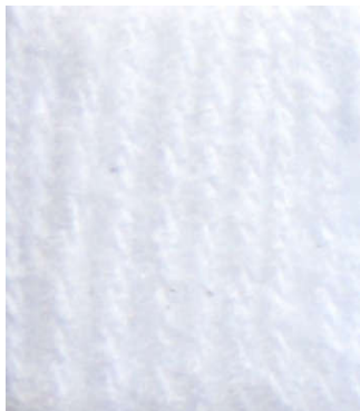
8001 Blanco White