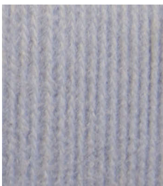
8045 Gris Gray