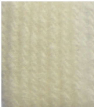
8020 Crudo Ecre