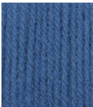
8051 Azul Azafata Royal Blue