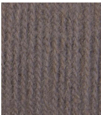
8052 Marrón Topo Taupe